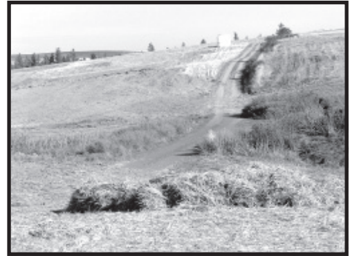
Equipment plugs, pictured above, may be burned under a written permit.