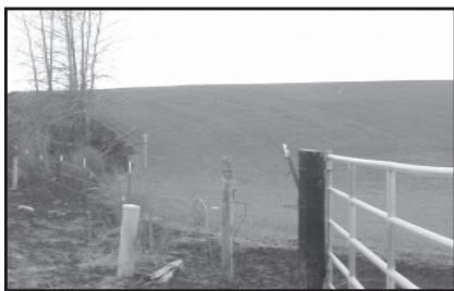
Burning along fence lines may be conducted under certain conditions.