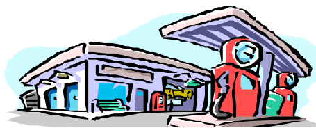
Table 1. National Air Toxic Standards for Gasoline Dispensing Facilities (GDF) (40 CFR 63, Subpart CCCCCC) 1