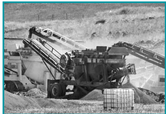
A portable stationary source, such as this rock crusher, is expected to be moved and operated at another site.

For more information about NOC and NOI applications, call us at 477-4727 or visit www.spokanecleanair.org/compliance_resources.asp .